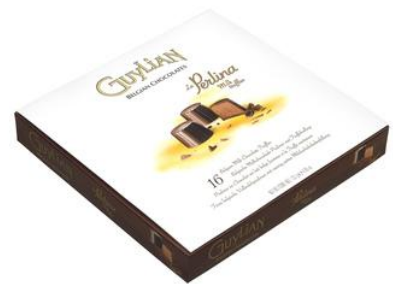
La Perlina Milk Truffles - gift box 132g – 16 pieces