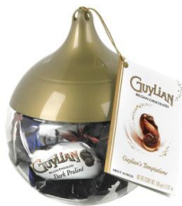
Guylian's Temptations Christmas ball 108g – 10 pieces