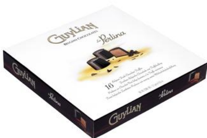
La Perlina Dark Truffles - gift box 132g – 16 pieces