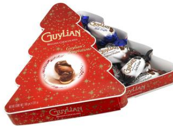
Guylian's Temptations Christmas Tree 108g – 10 pieces