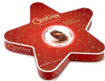
Guylian's Temptations Christmas Star 150g – 14 pieces

For celebrations such as Valentine's and Mother's Day there's a new heart shaped box, elegantly decorated with golden and red curls.