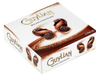
Seahorse chocolates Original Praliné 46g - 4 pieces