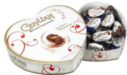
Guylian's Temptations Heart box 173g – 16 pieces