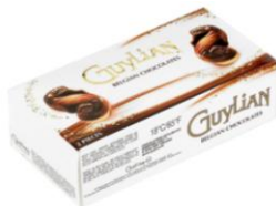
Seahorse chocolates Original Praliné 23g - 2 pieces

For informal every day gifting or self-indulgence Guylian offers the Original Praliné seahorse chocolates in a 2 or 4 piece pack.