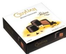
La Perlina Dark Truffles - trial pack 33g – 4 pieces